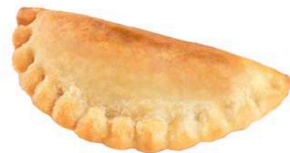
Cheese And Bacon