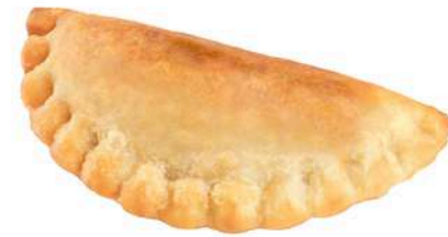
Nutella and Cheese